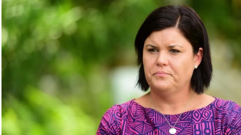
Natasha Fyles MP

Land Down Under, Northern Territory Chief Minister Natasha Fyles, Thumbs up Fracking Beetaloo Basin, Deliberately combusting One point four billion Carboniferous subsidised tonnes: Broil oceans Pollute atmosphere Murder Great Artesian Basin (Mother's largest Underground water).