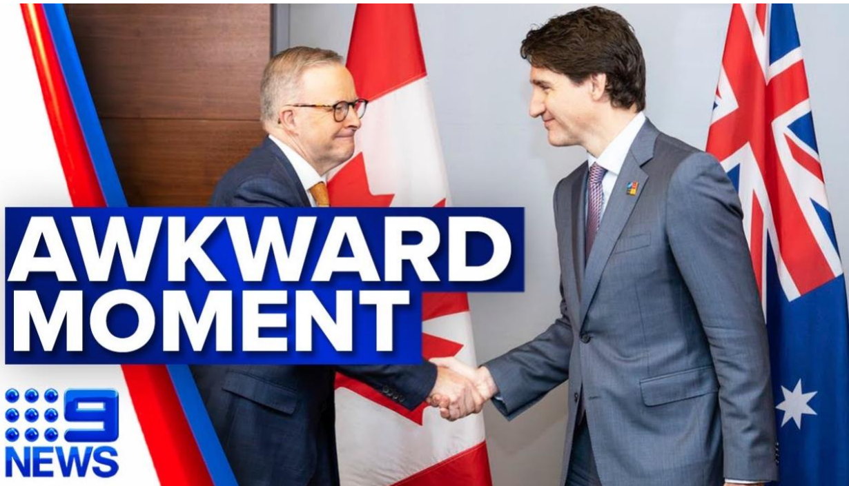
Prime Minister's Anthony Albanese (l) Justin Trudeau (r)