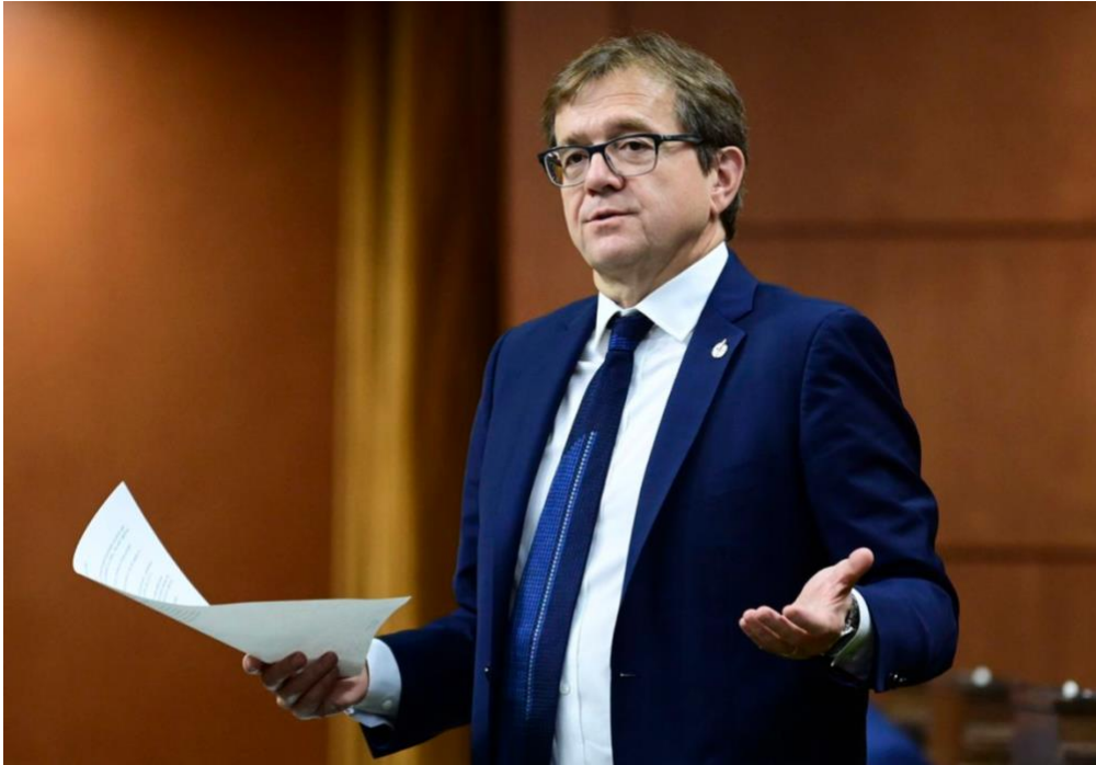
Jonathan Wilkinson MP

Minister Natural Resources Jonathan Wilkinson, Twenty-four occasions Wining dining extravagances Department, Minister, high life, Budgetary fuel subsidies fatten'd! Unmeaning net-zero Effectively promoted, Tar sands, fracking, pipelines Forever Baby!