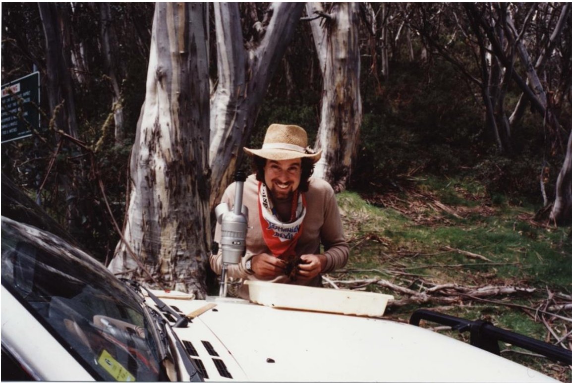
Reese Halter conducting snow gum root physiology research on Mount Stirling, Victorian Alps, circa 1993.

Defend snow-making chapels, Tree-sits Circuit Road woollybutt blockades, Earthly heaven under siege, Last straw. Readying For whatever comes! © 2022 Reese Halter